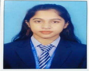
Passport size photo with formal attire of background of single color

Career Objective: Desirous for a challenging role in a reputable workplace to utilize my management skills for the growth of the organization as well as to enhance my knowledge about new and emerging trends in the corporate sector.