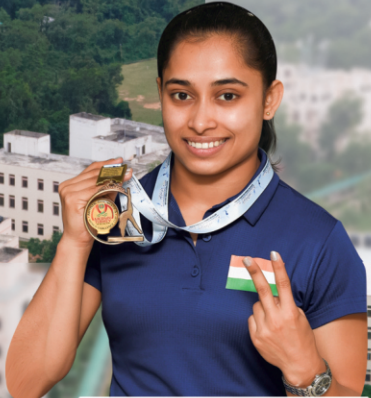
Padma Shri DIPA KARMAKAR Brand Ambassador, IUT