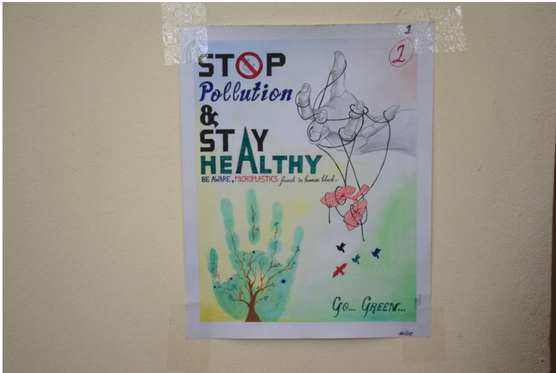
Preserving nature is of utmost importance – depicted beautifully through this poster – on the occasion of World Health Day, at ICFAI University, Tripura on 7.04.2022.