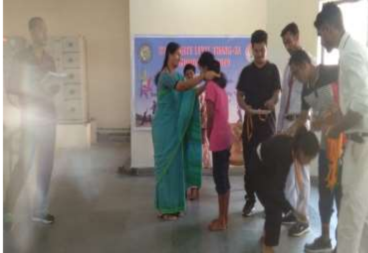
Medal distribution ceremony