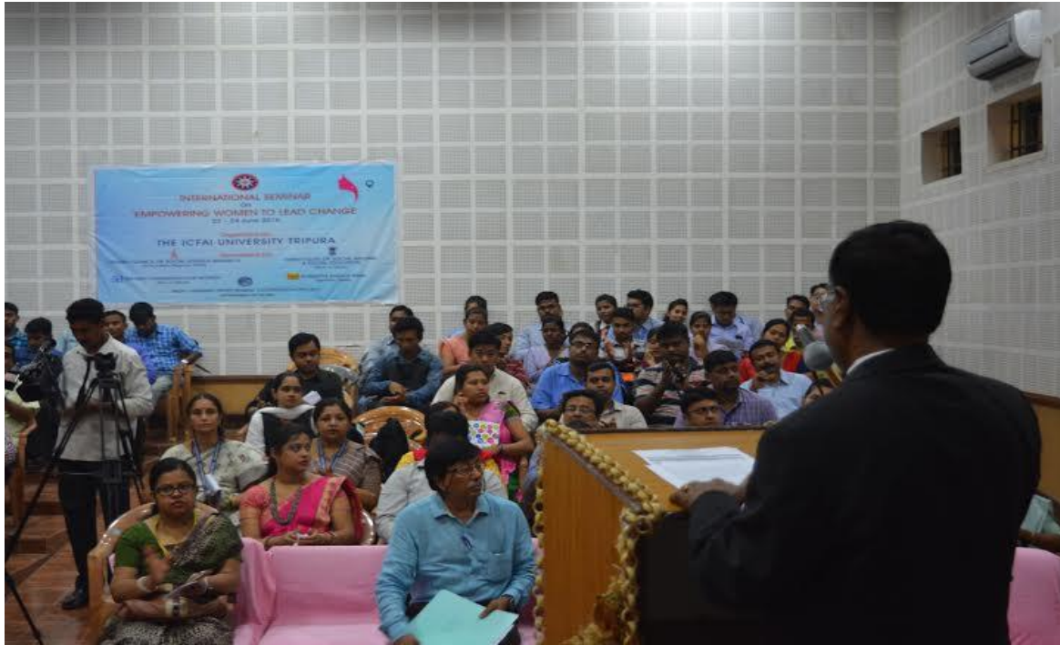
A part of the audience during the International Seminar on “Empowering Women to Lead Change”, 23 – 24 June 2016 at the ICFAI University Tripura.