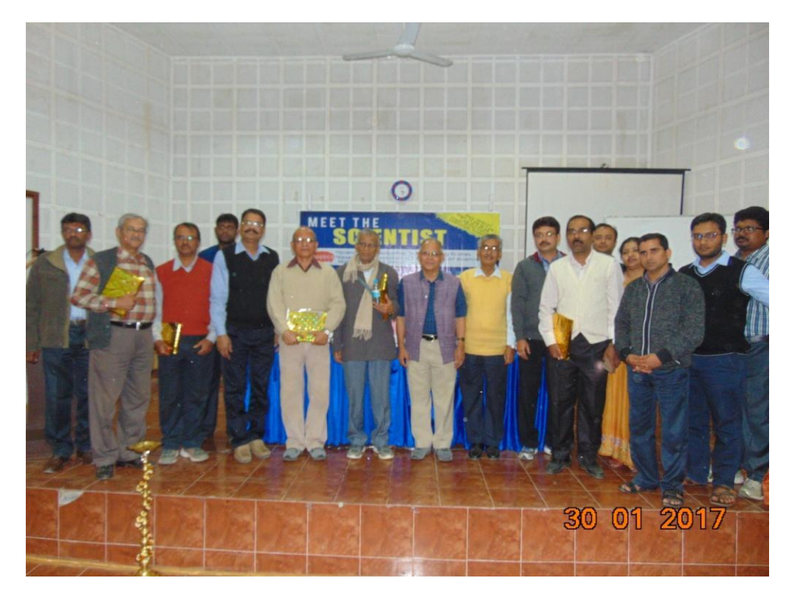
Group photo of Dignitaries and Faculty members during lecture sessions on "Science Communication in Engineering Studies" and "Research Methodology in Education & on Science & on Mathematics Teaching".