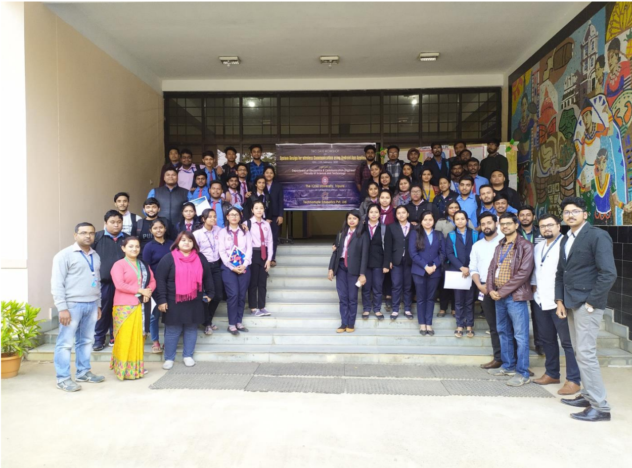
# Certificate distribution to the participants by Technomate # Group photo at the end of the workshop in front of IUT academic building