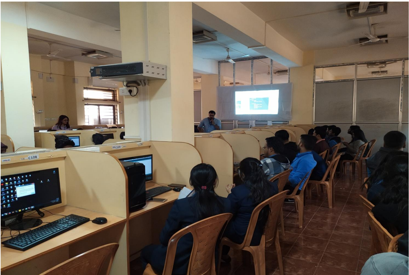
# Technical sessions of two complete days were conducted at Computer Lab 4. Around 65 students participated in this hands-on workshop