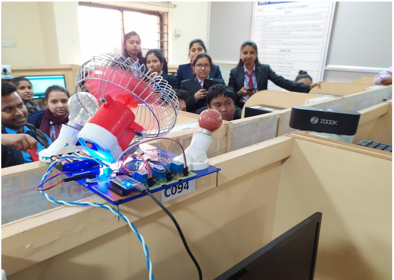
# Demonstration of Robotics and IoT applications by Technomate persons