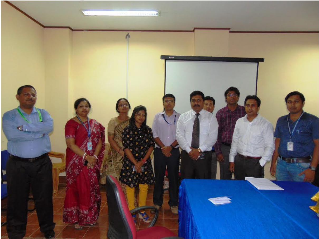
The Recruitment team of Indusind Bank along with Faculty Members and Staff of the ICFAI University Tripura during the Campus Placement Drive on 28.04.2016.