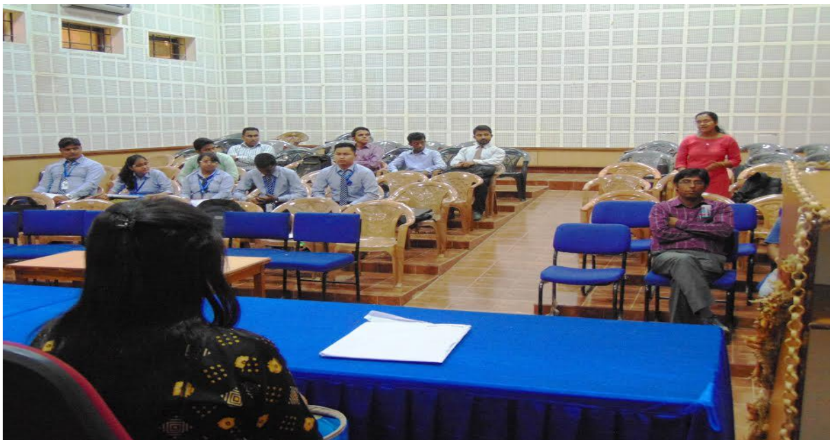
Student interacting with the Recruitment Team of Indusind Bank Ltd. during the Campus Placement Drive at the ICFAI University Tripura Campus on 28.04.2016.