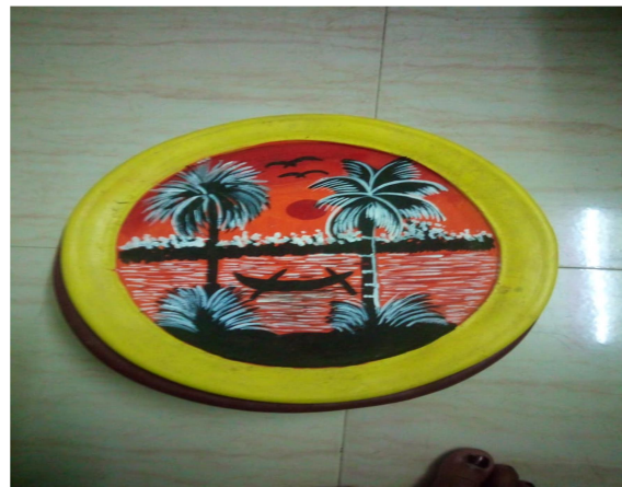
Clay Plate painting