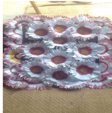
Craft work by Paper