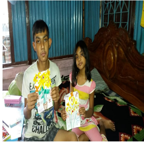
Card making by paper cutting