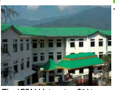
The ICFAI University, Sikkim