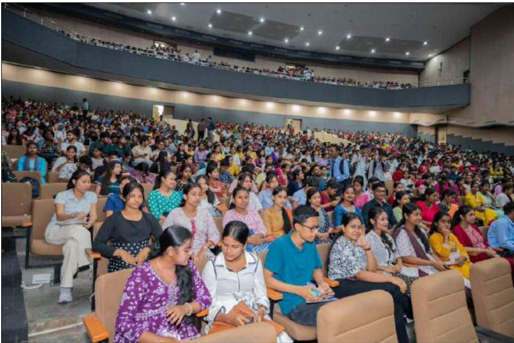
A scene from The ICFAI University, Tripura organized a " Topper Felicitation Ceremony " for TBSE & CBSE Class XII First Division Holders, along with a " Career Achievers Award " session titled "UDAAN", held at Rabindra Satabarshiki Bhawan, Agartala on 18.07.2025.