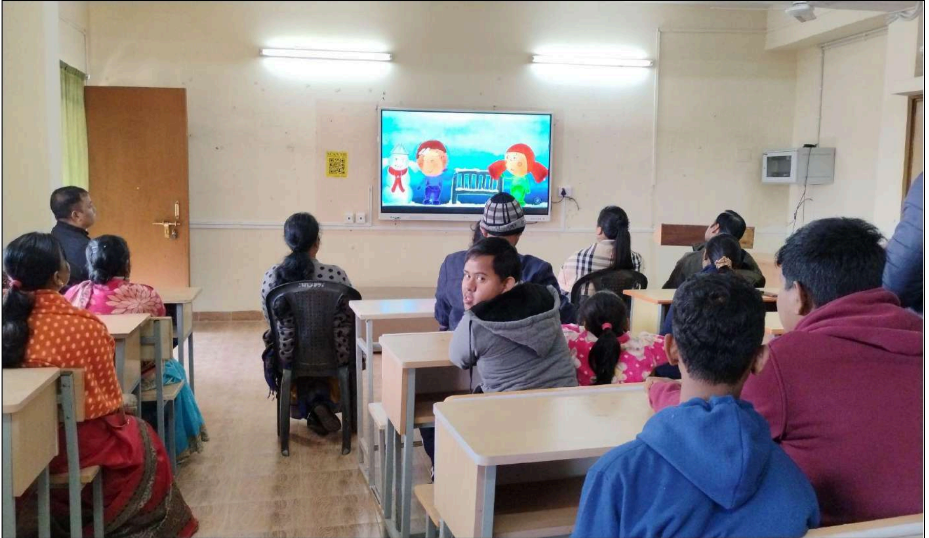
Video presentation by Mentors

The Department of Special Education & Rehabilitation of the ICFAI University, Tripura has celebrated " World Braille Day " by organizing an event on the theme: " Every Child Can Learn " on 04.01.2025. The trainee students of the department have participated in debate and quiz competitions, and TLM presentations. The Differently able children of Special Educational Lab, IUT, and their parents have actively participated in this event.