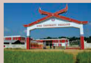
The ICFAI University, Nagaland