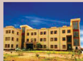
The ICFAI University, Raipur