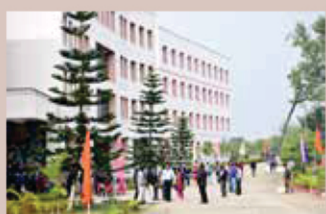
The ICFAI University, Tripura

ICFAI has established 11 Universities across India. The ICFAI Universities are located at Hyderabad [The ICFAI Foundation for Higher Education (IFHE), which is a Deemed-to-be University], Himachal Pradesh (Baddi), Dehradun, Jaipur, Jharkhand, Meghalaya, Mizoram, Nagaland, Raipur, Sikkim and Tripura