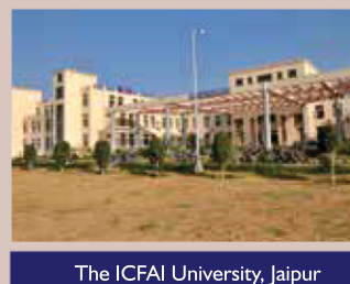
The ICFAI University, Jaipur