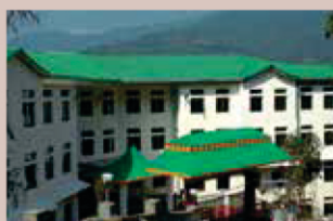
The ICFAI University, Sikkim