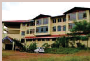
The ICFAI University, Meghalaya