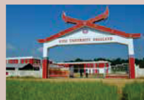
The ICFAI University, Nagaland