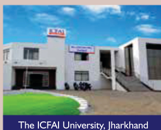
The ICFAI University, Jharkhand