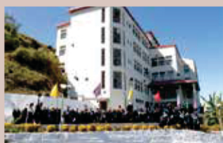
The ICFAI University, Mizoram