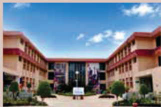
The ICFAI University, Dehradun